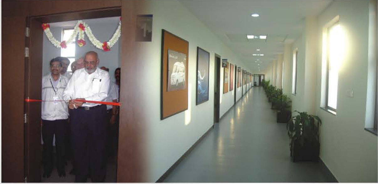
New Advanced Training Centre Inaugurated at Akurdi