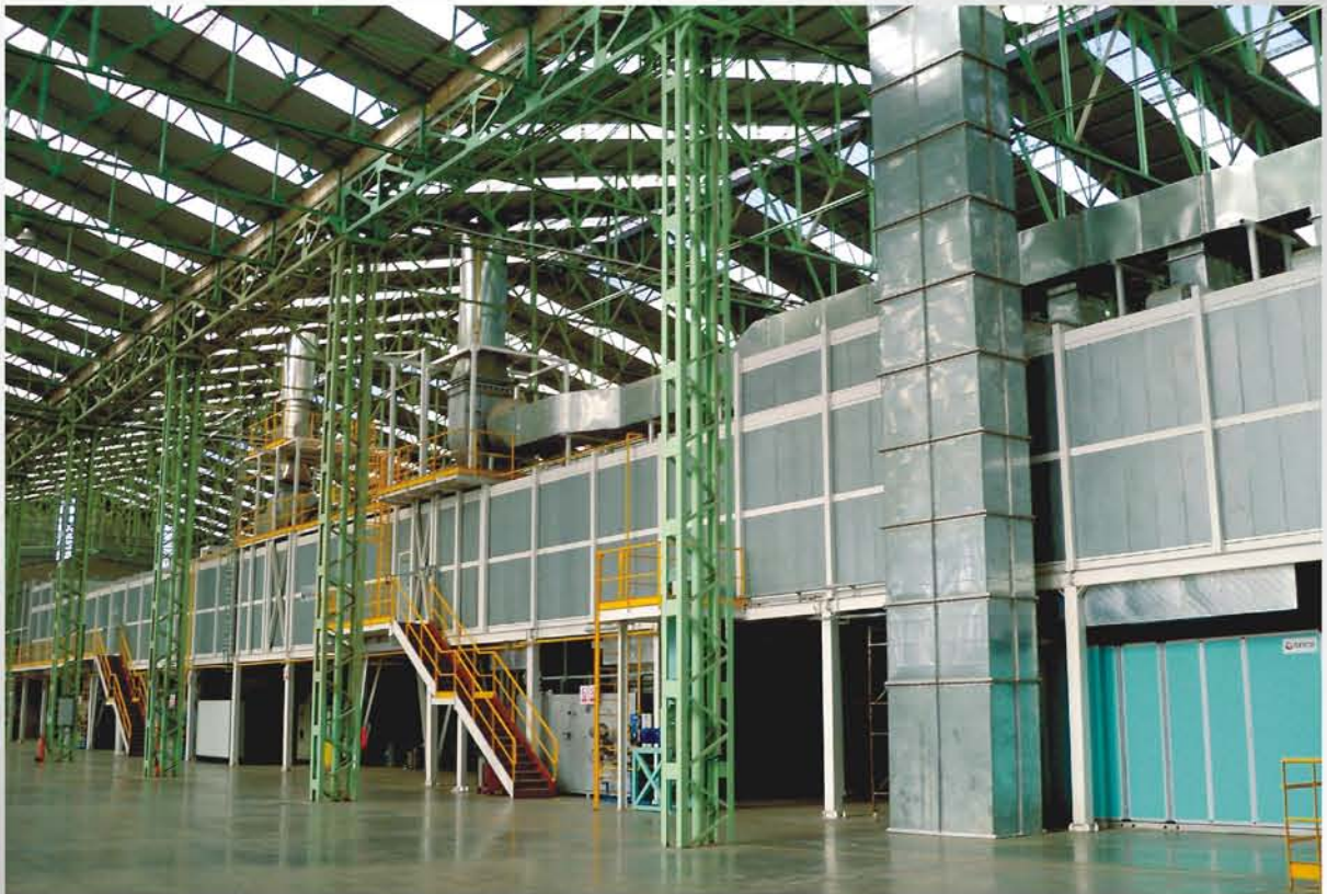
New Cathodic Electrodeposition Paint Shop Inaugurated