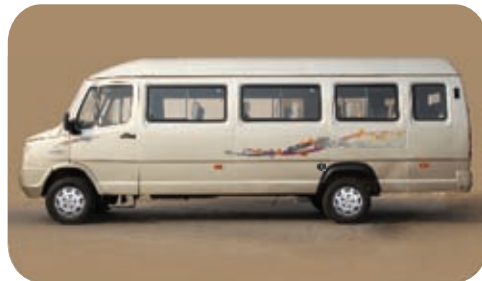
Longest Monocoque Vehicle in India