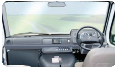
Wider Wind screen for better visibility