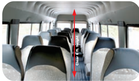
Clear Standup Height of 6 feet.