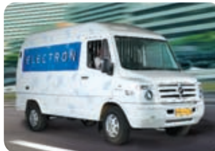
Large Branding Area