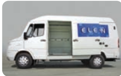
Sliding door for kerb side delivery