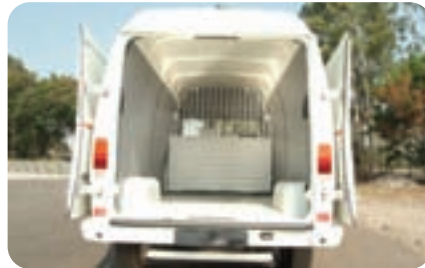
270° opening twin leaf Rear Doors for easy loading & unloading