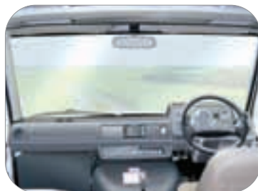
Wider Wind Screen for better visibility