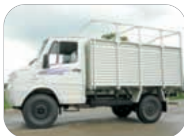
High Side Deck