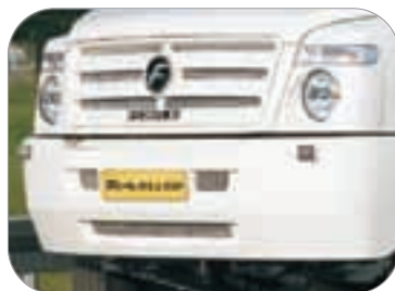
Attractive Front Facia, New Grill & Bumper