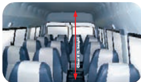
All Forward Facing High Back Seats (17+D) Clear Standup Height of 6 feet.