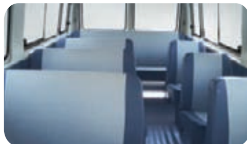
All Forward Facing Standard Seats (17 + D)