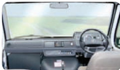
Wider Wind screen for better visibility