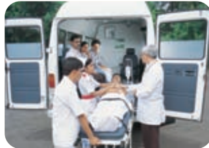
Low Floor Height - Easy Entry & Exit