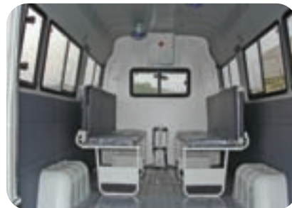
Factory made stretcher & Medicine Cabinet