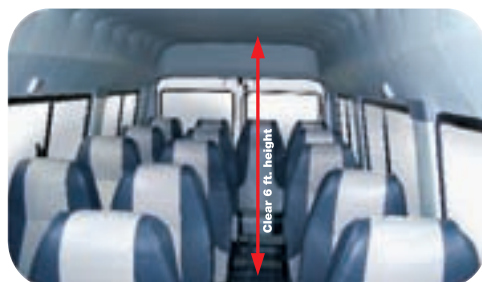
Clear Standup Height of 6 feet.