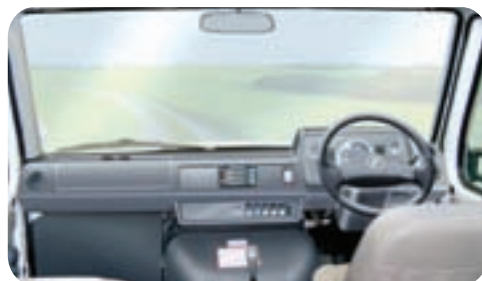
Wider Wind screen for better visibility