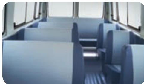
All Forward Facing Standard Seats (12 + D / 14 + D)