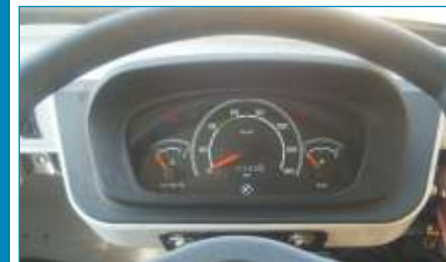
Stylish instrument panel