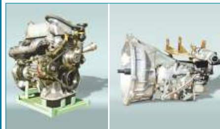
TD-2000 F DI Diesel Engine & G 17 / 4B Gearbox