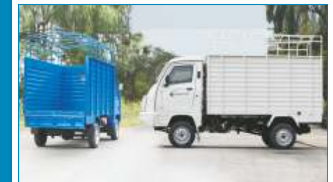
Rear View and Side View

NOTE : On account of continuous Research and Development, specifications are subject to change. The data included herein is to be regarded as approximate. Accessories shown may not necessarily be part of standard equipment.