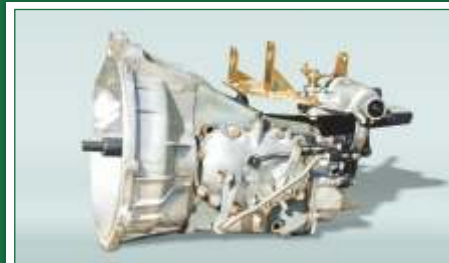
G 17 / 4B Speed Gearbox