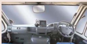
Wider Wind Screen and ITES Integrated Dashboard Controls