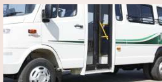
Jack Knife Door & Low Footstep Easy Entry & Exit