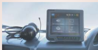
GPS Navigation and Passenger Information System