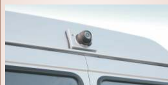
Rear Reverse Parking Camera Convenience & Safety