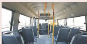
Stanchion Bars & Wide Gang Way Easy Internal Movement