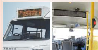
Passenger Information System, Internal Camera and Stop bell Button