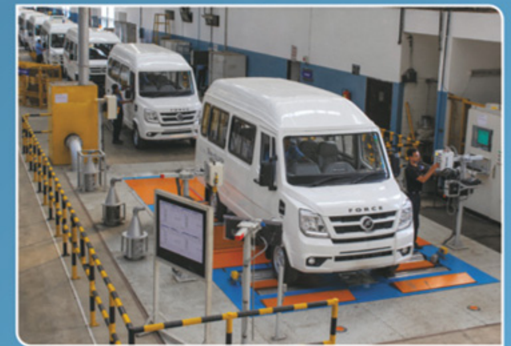
Automated assembly line with roller bed test