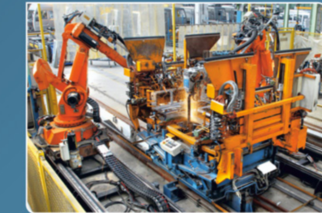
Robotic Welding – made entirely of pressed steel panels