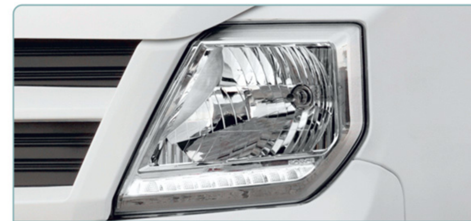
New Advanced Lighting System – Signature DRLs and sharper illumination for enhanced visibility