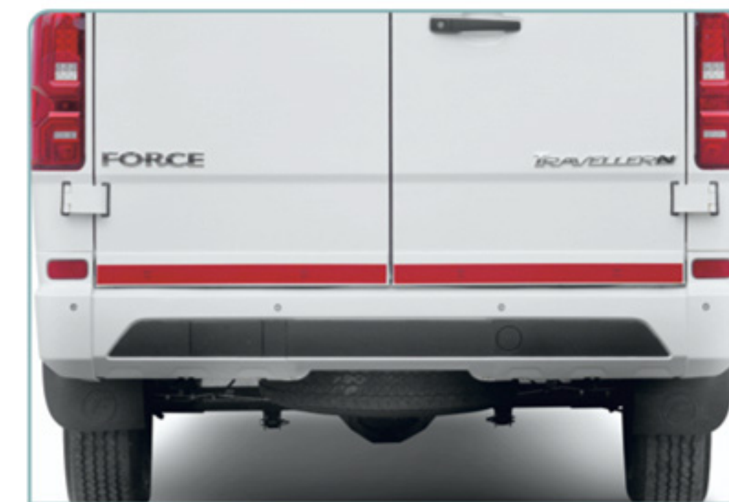
New Rear Bumper – Built for enhanced strength and protection