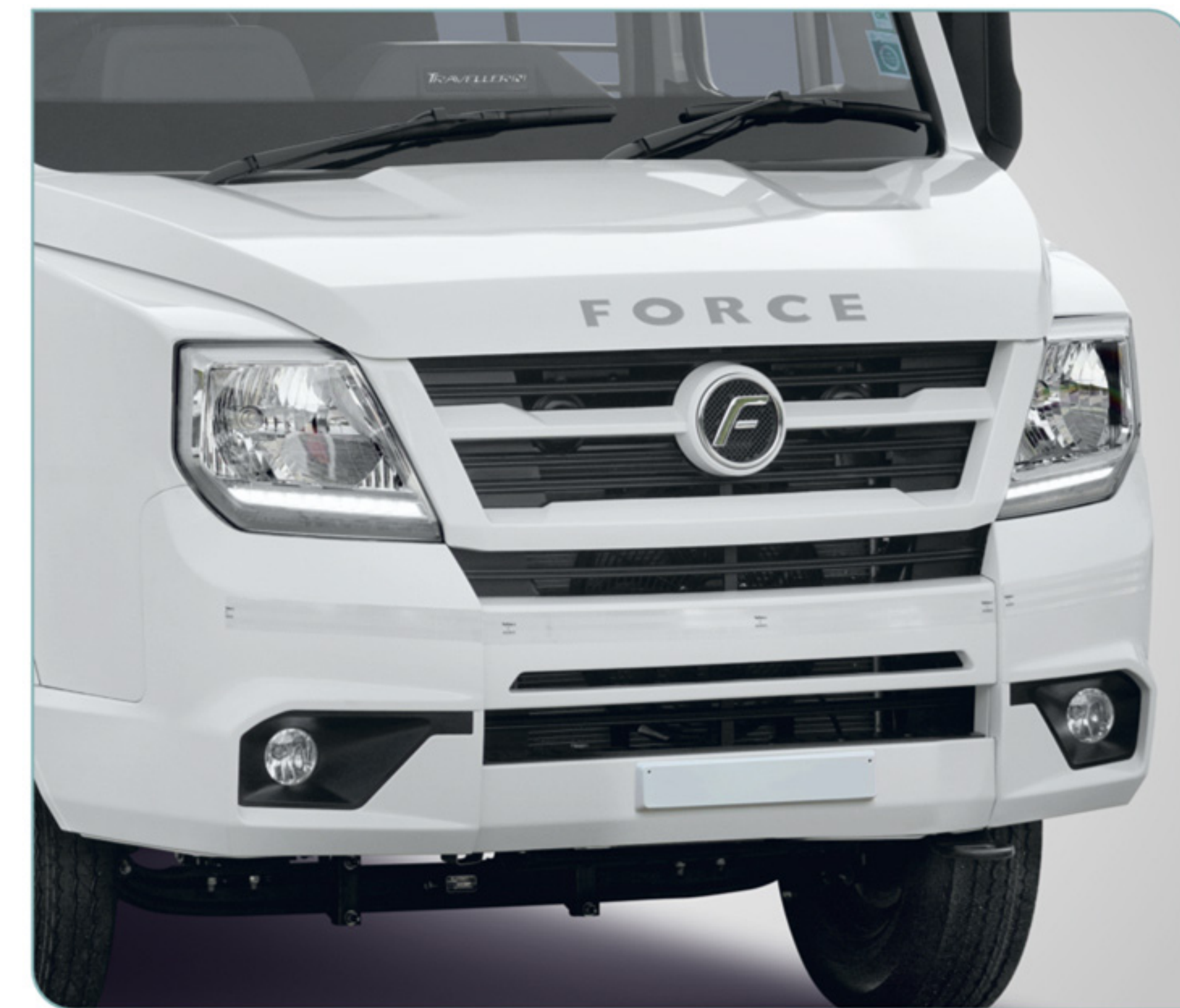
New Front Fascia – Redesigned for a distinctive look, redefined for durability & sculpted for a stronger presence