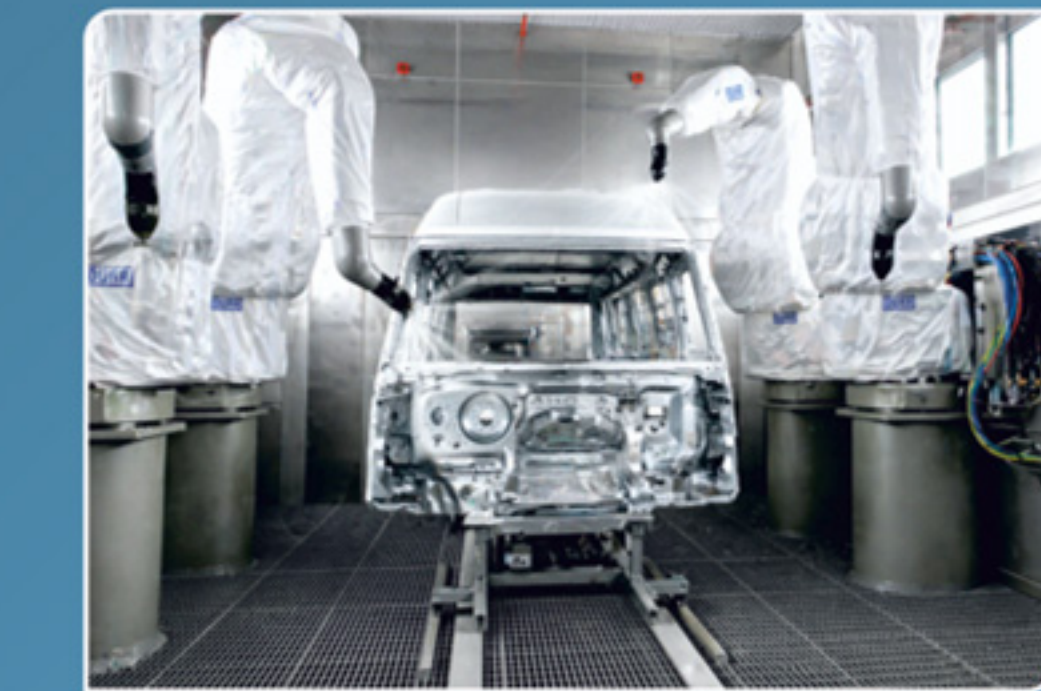
Robotic Painting for car-like gloss and even paint finish