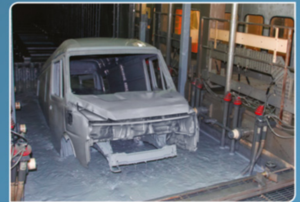
7th Generation CED Painting for unmatched corrosion resistance