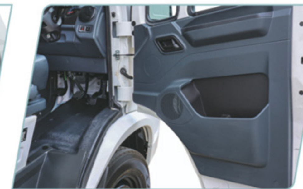
New car like designed door pads with smart storage