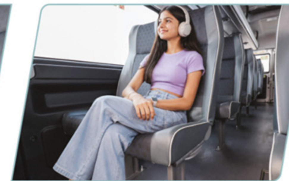
Quieter cabin with improved insulation – least NVH