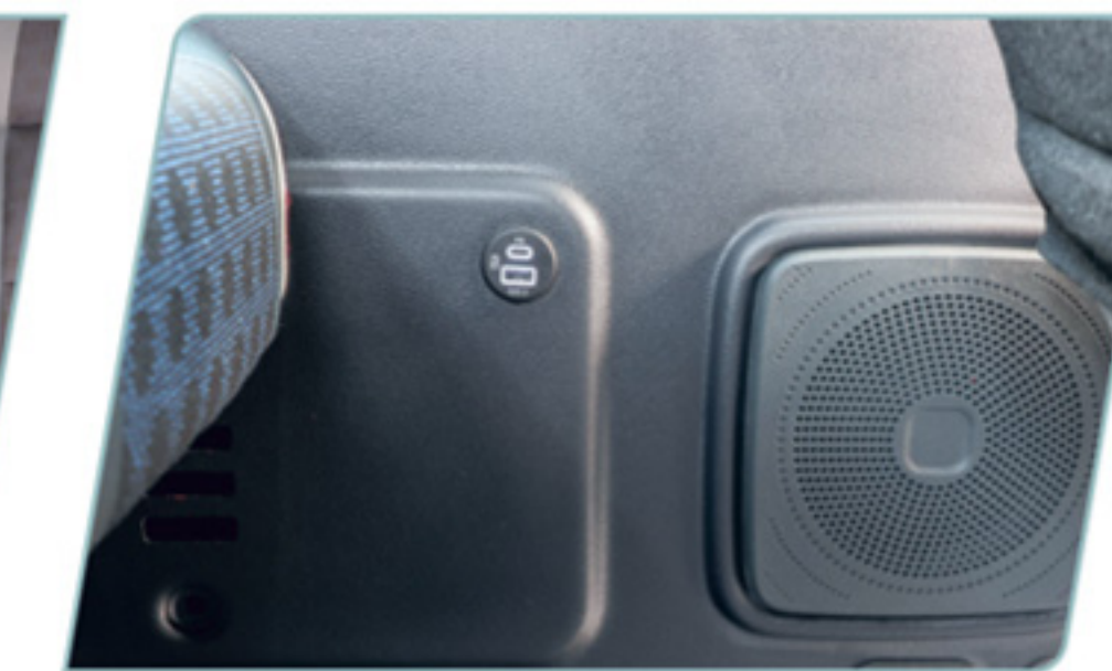
Smart charging with USB and C-type port with provision for speakers