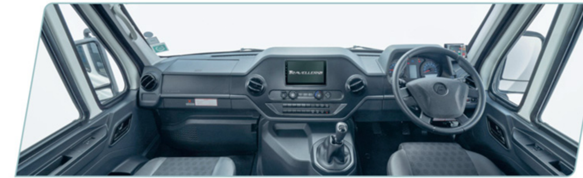
All-new dashboard and digital instrument cluster – Ergonomically designed driver oriented layout with seamless access and controls