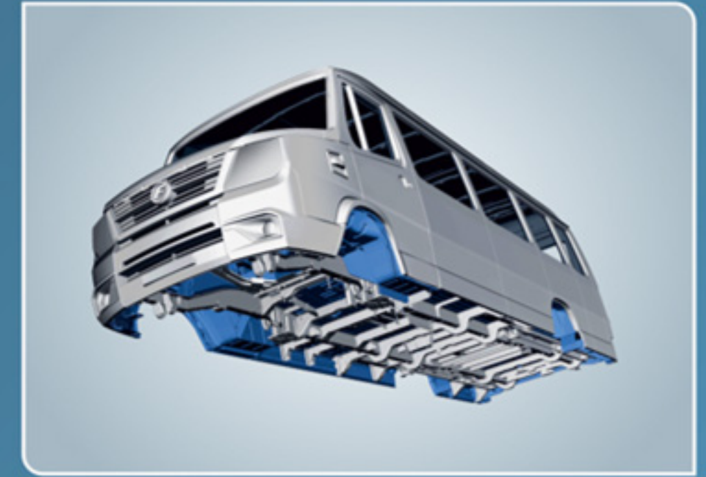
Monocoque design for outstanding structural strength