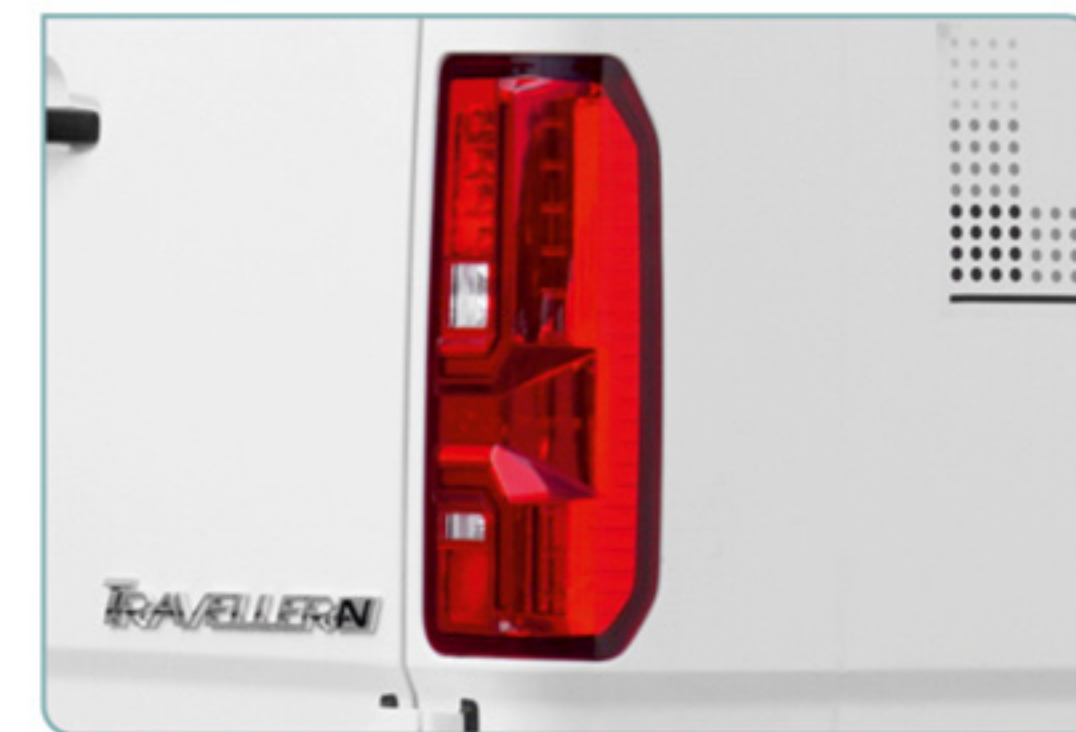
New Tail Lamps – Sleek LED lamps for improved visibility and ensuring clear and glare controlled function