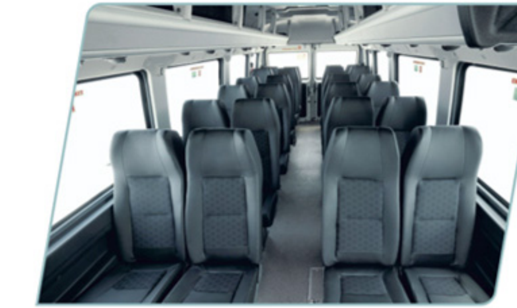
New interiors trims with spacious seating

Comfort and convenience come together to define a new standard in mobility. Thoughtfully designed for both passengers and drivers, the New Traveller N , with new interiors enhances every aspect of the ride – offering greater seating comfort, improved ergonomics and intuitive features that make operation easier and more efficient.