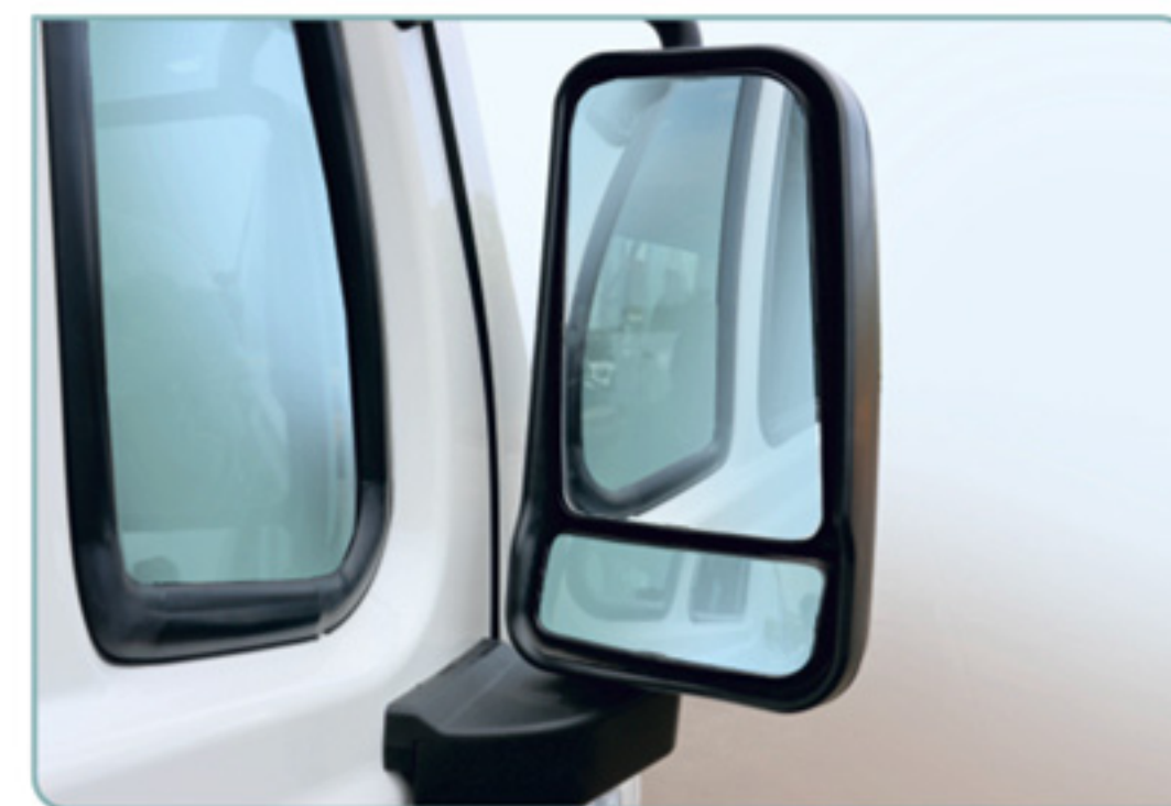
New Outside Rear View Mirrors – Ensures enhanced visibility and better control