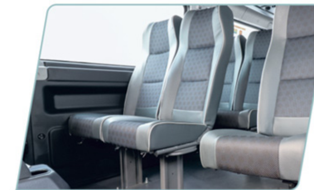
New modular side trims and new seats with enhanced contours