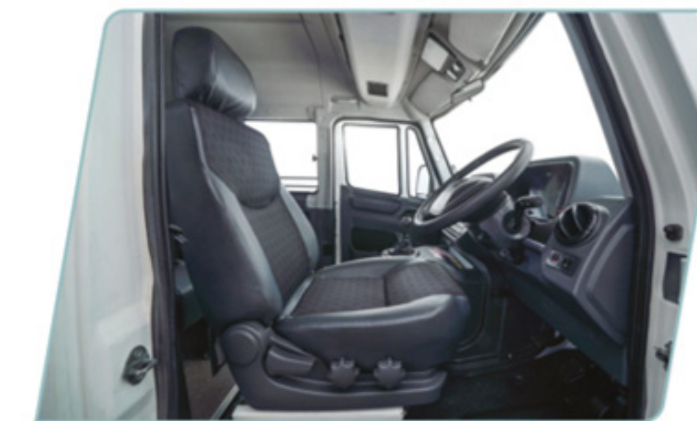
Adjustable and comfortable superior seating for driver