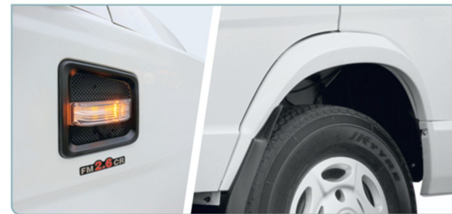
New Fender & New Side Blinker Lighting – Designed for better signalling and clearer all round visibility