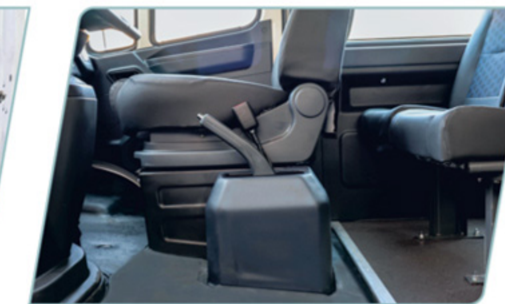
New ergonomically designed parking brake lever