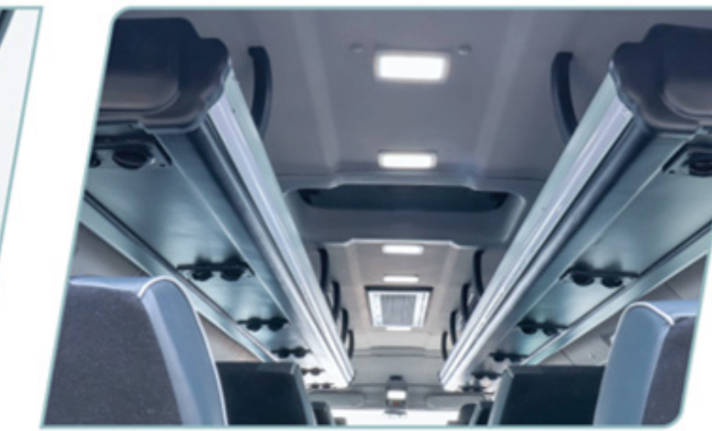
All-new powerful HVAC system & New superior LED powered cabin illumination